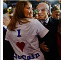
Television Starts to Court the Young Voter