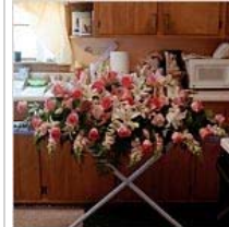
Gunshots, Then Silence: And the Sorrow Spreads