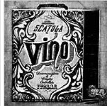
Op-Ed: Drink Outside the Box