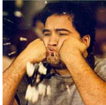
The Refined Art of Tastelessness