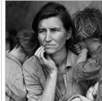
Recalling a Mission to Capture an Era's Misery